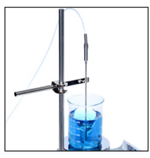
Support Rod and Clamp Kit