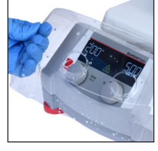
In Use Cover

*40 accessories available for Guardian Series